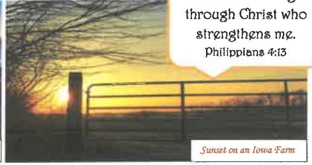
Sunset on an Iowa Farm

I can do all things through Christ who strengthens me. Philippians 4:13