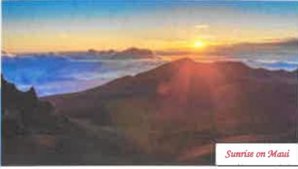
Sunrise on Maui